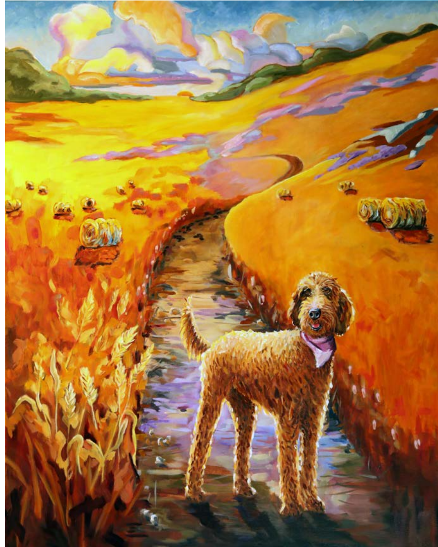
Ann Vreeland, Sunshine , Oil on canvas, 24 x 30 in. 2019