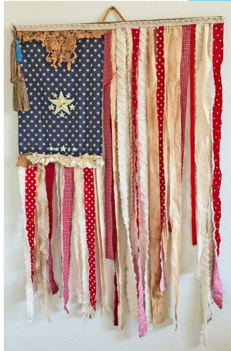
Mary Jayne Yada, American Flag . Mixed media 29 x 46 in. 2019