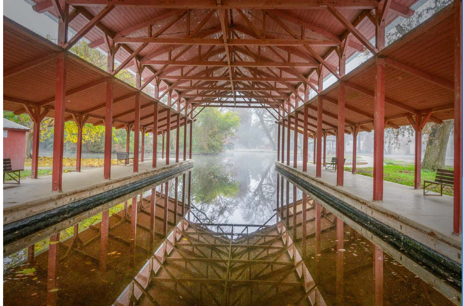
Gary Greeni, Mooney Grove Boat House . Color print, 2019